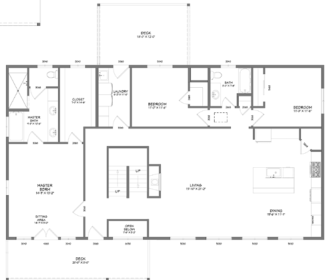
SECOND FLOOR PLAN SCALE 1/4" = 1'

This image is an architectural rendering. Village Homes, LLC reserves the right to make changes or modifications to plans, elevations, specifications, materials, features, colors, and other guidelines without notice. Prices and product availability are subject to change. All maps, images, and renderings are conceptual and are not to scale.